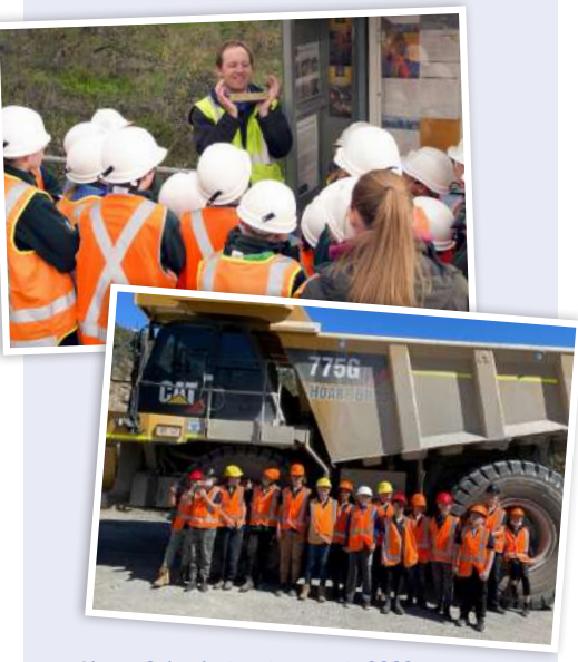
Above: School mine site tours in 2022.

Learn about mining careers from local people working in the industry.