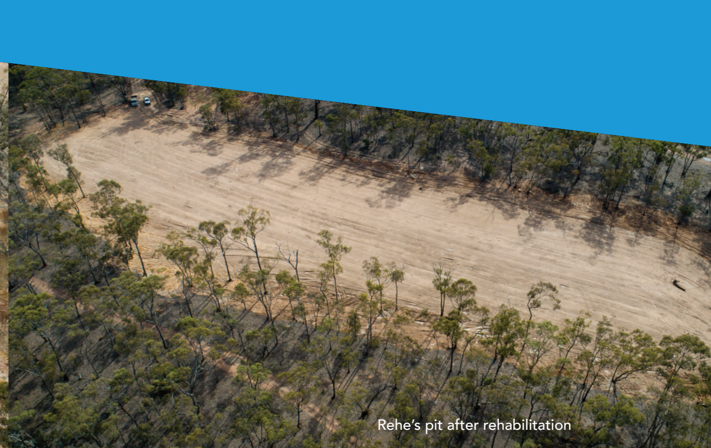
Rehe's pit after rehabilitation