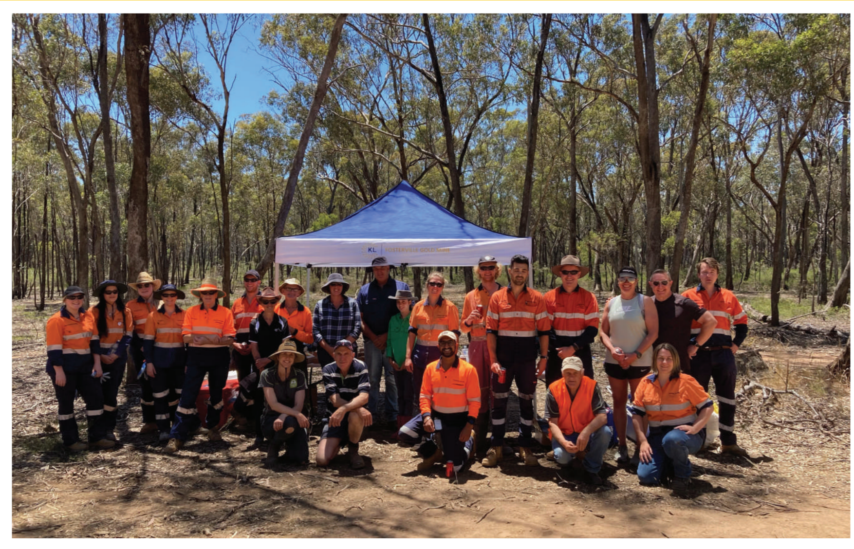
We carry out regular Clean-up Days on the land surrounding the mine

FGM's environmental performance is reported via quarterly Environmental Review Committee meetings, statutory reporting, the National Pollutant Inventory, and the National Greenhouse and Energy Reporting Scheme.