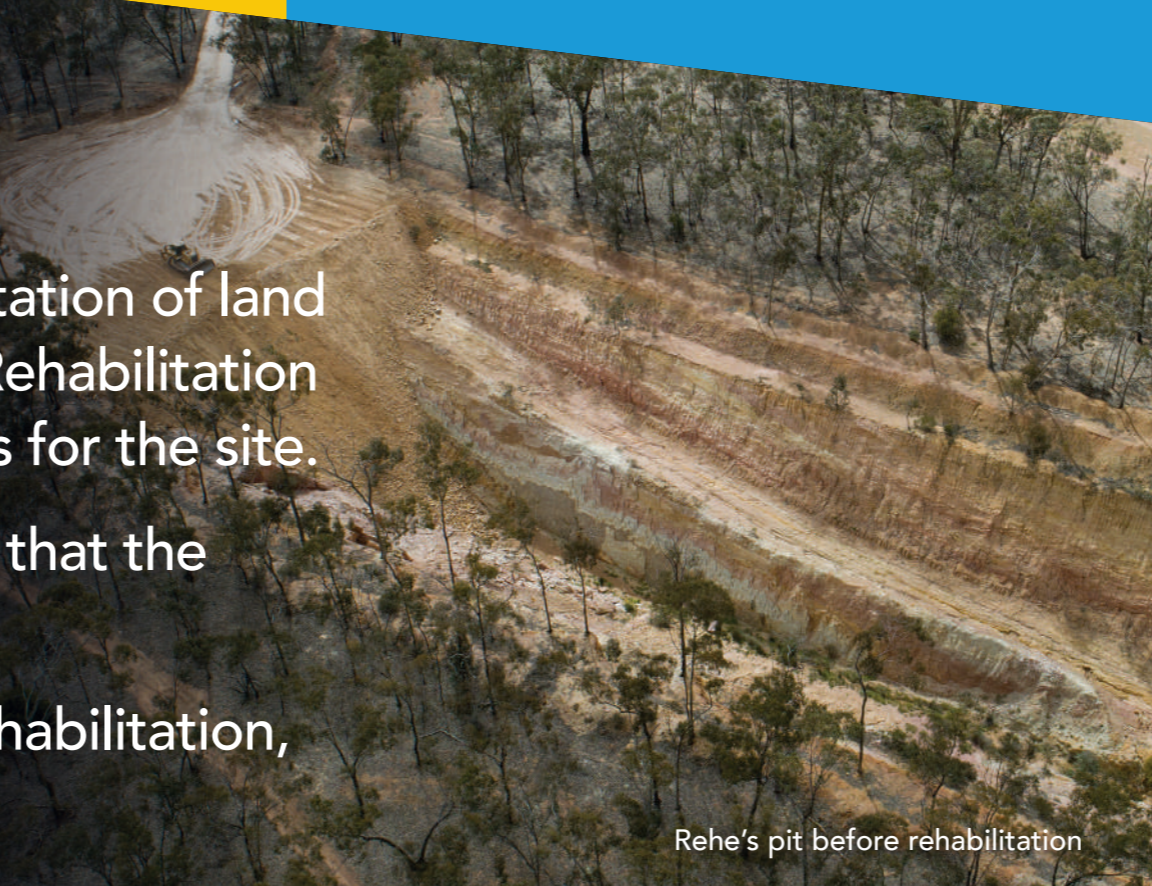
Rehe's pit before rehabilitation

A great example of our commitment to progressive and effective rehabilitation, is the backfilling and revegetation of Rehe's Pit.