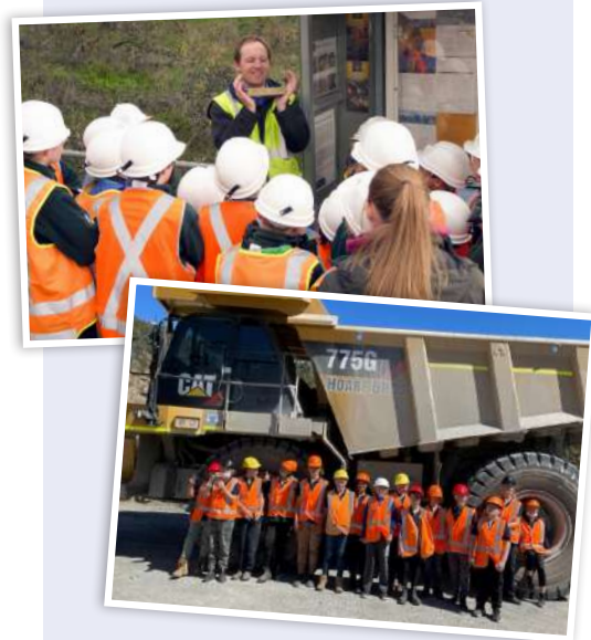
Above: School mine site tours in 2022.

Images below courtesy of Agnico Eagle (Fosterville gold mine)